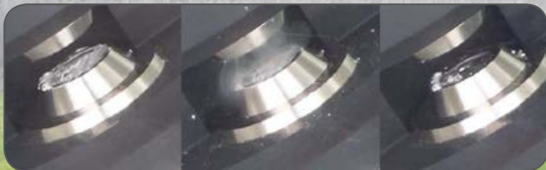
Cleaning effect of the WTW ultrasonic cleaning technology

Measuring even in corrosive media? No problem with this sensor. The high-tech materials Titanium and PEEK as well as the measurement windows made of sapphire glass are making the sensor particular resistant against external influences.